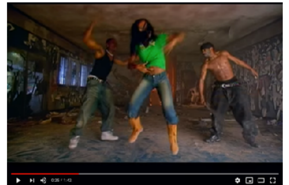
Trailer zu RIZE, einer Dokumentation über KRUMP