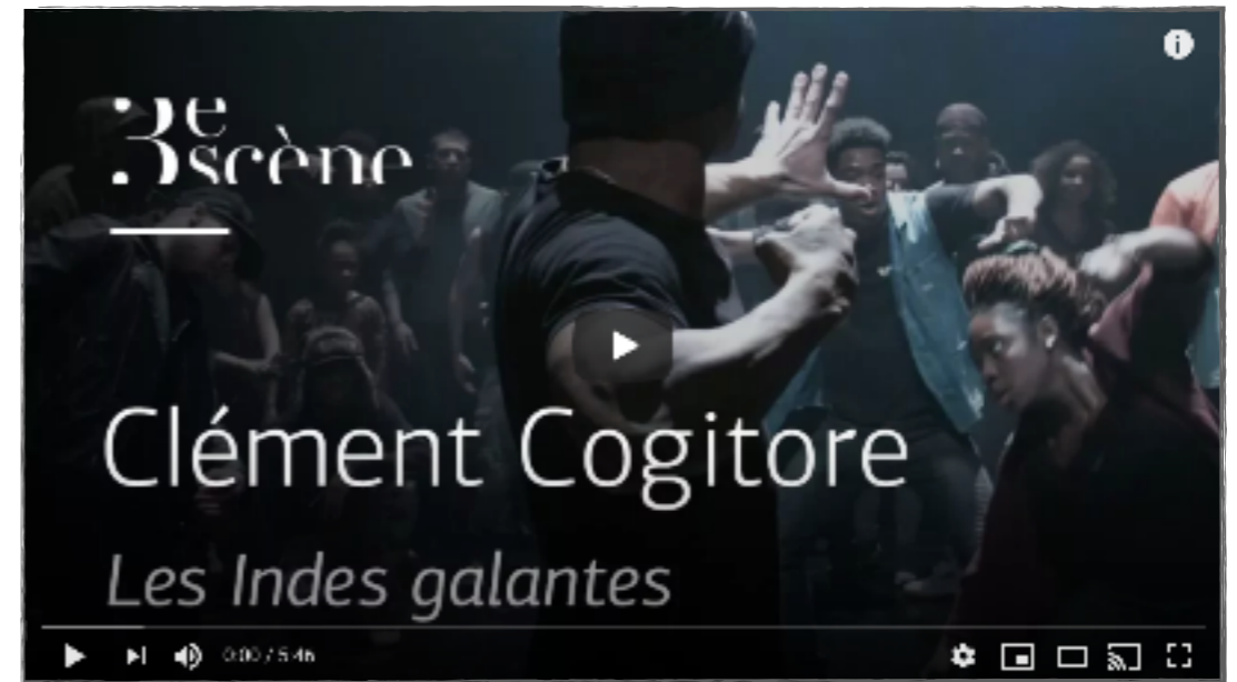
„Les Indes galantes“ by Clément Cogitore